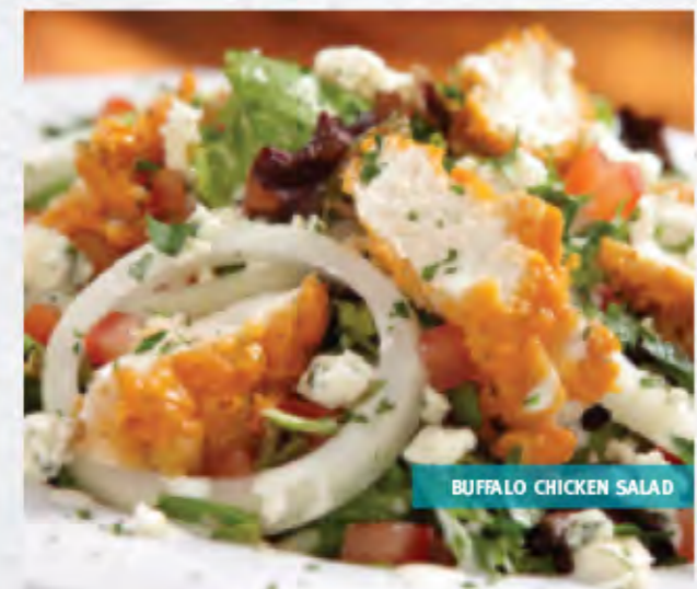
BUFFALO CHICKEN SALAD