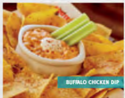
BUFFALO CHICKEN DIP