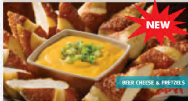
BEER CHEESE & PRETZELS