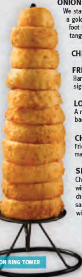
ONION RING TOWER