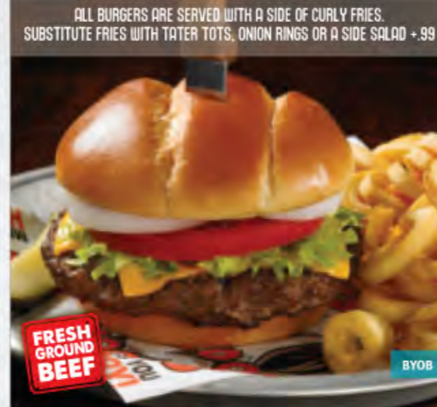
FRESH GROUND BEEF