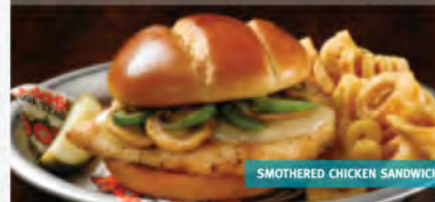
SMOTHERED CHICKEN SANDWICH

ALL SANDWICHES ARE SERVED WITH A SIDE OF CURLY FRIES. SUBSTITUTE FRIES WITH TATER TOTS, ONION RINGS OR A SIDE SALAD +.99