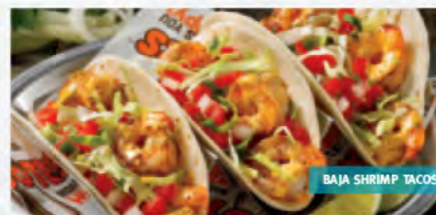
BAJA SHRIMP TACOS

Make it a Texas Cheesesteak with queso, Daytona Beach sauce, pico de gallo and sliced jalapeños +.99