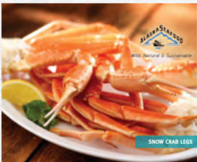
SNOW CRAB LEGS