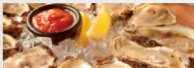
OYSTERS* Half or One Dozen. Raw on the half shell.

SEAFOOD? WE'VE GOT THAT. IT MAKES SENSE. SEEING AS HOW THE FIRST HOOTERS WAS BUILT IN CLEARWATER, FL. STEAMED SHRIMP? YUP. SNOW CRAB LEGS? CHECK. ICONIC HOOTERS GIRLS? YES. WE'VE GOT THAT TOO. SO ORDER UP. DIVE RIGHT IN AND ENJOY THE VIEW.