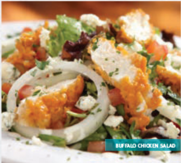
BUFFALO CHICKEN SALAD

Upgrade to blackened Mahi-Mahi instead of fried chicken 4.29