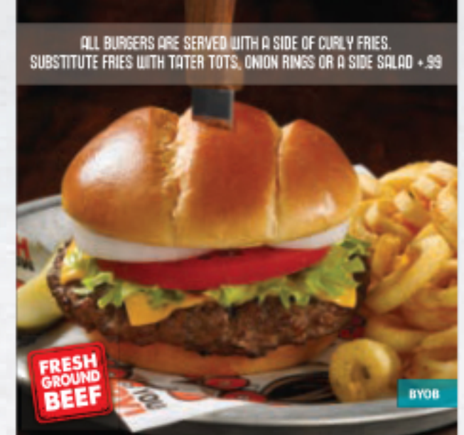
FRESH GROUND BEEF

WESTERN BBQ BURGER* BBQ sauce, melted cheddar cheese, bacon and onion rings piled high on a toasted brioche bun. Giddy up. 12.29