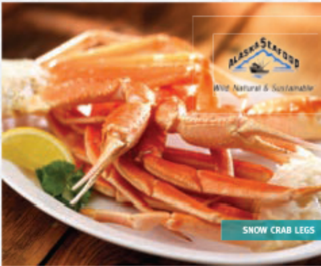
SNOW CRAB LEGS