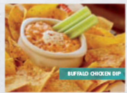
BUFFALO CHICKEN DIP