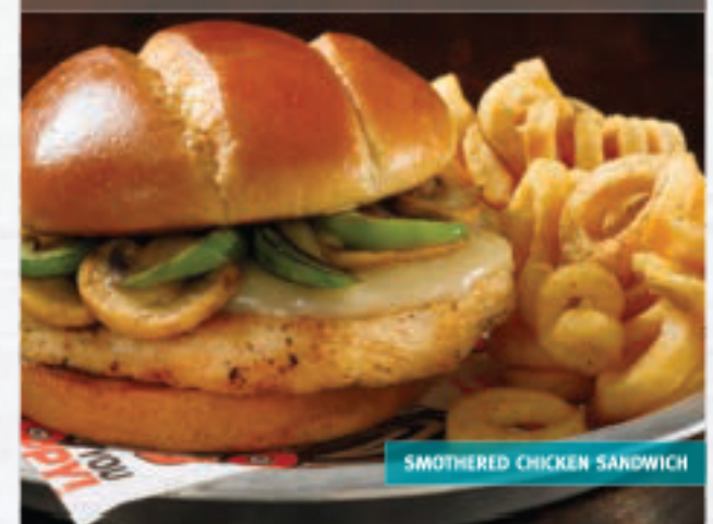
SMOTHERED CHICKEN SANDWICH

ALL SANDWICHES ARE SERVED WITH A SIDE OF CURLY FRIES. SUBSTITUTE FRIES WITH TATER TOTS, ONION RINGS OR A SIDE SALAD +.99