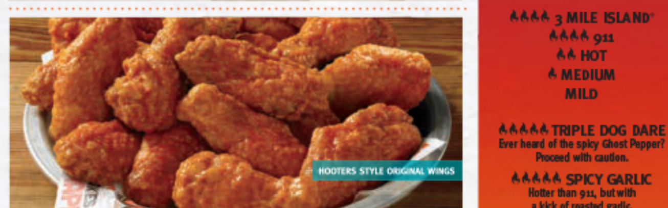
HOOTERS STYLE ORIGINAL WINGS

BONELESS WINGS Hand-breaded boneless wings served with your favorite Hooters wing sauce. And no bones, so they can get to your stomach faster. 6 PCS - 7.29 10 PCS - 10.49 20 PCS - 19.49 50 PCS - 45.29